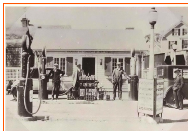
Standard Oil Station on Atlantic Ave.