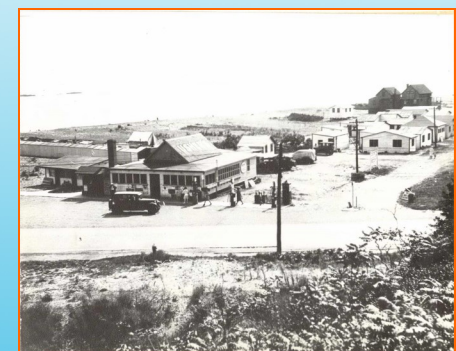
Usher's at Devereux Beach, Ocean Ave.