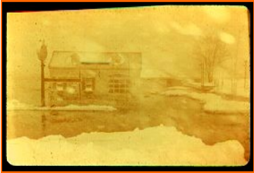
Jenny Station on Ocean Ave in a storm