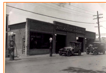
Atlantic Garage (see #11)