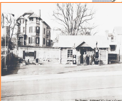
Tydol Gas Station on Vine St.

Only one public gas dock for boaters remains in Marblehead today—at Marblehead Trading Company on Front Street